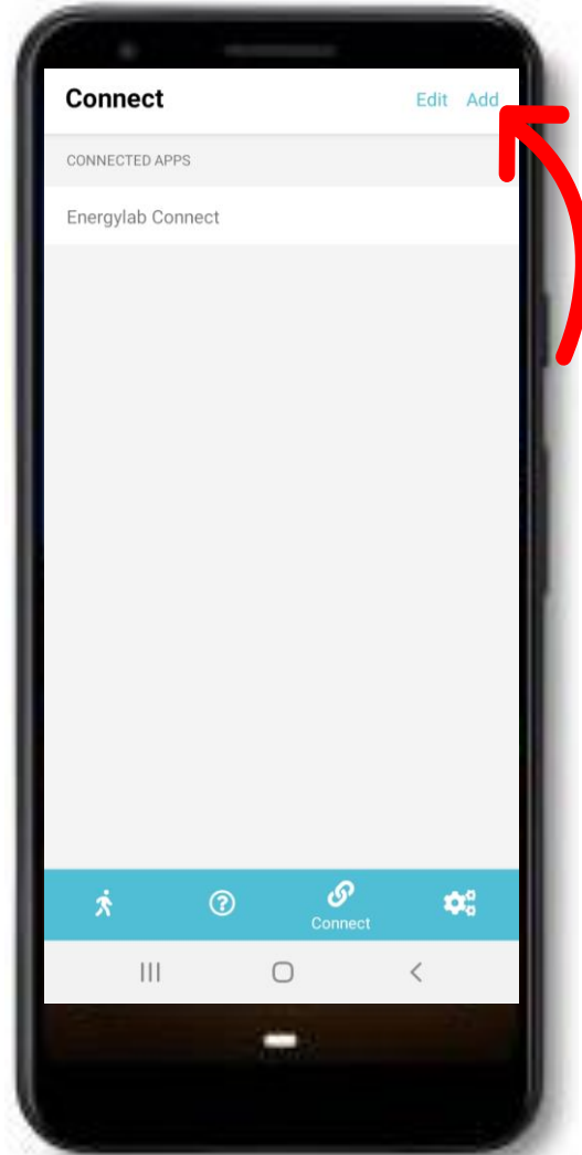
Click on 'Add'